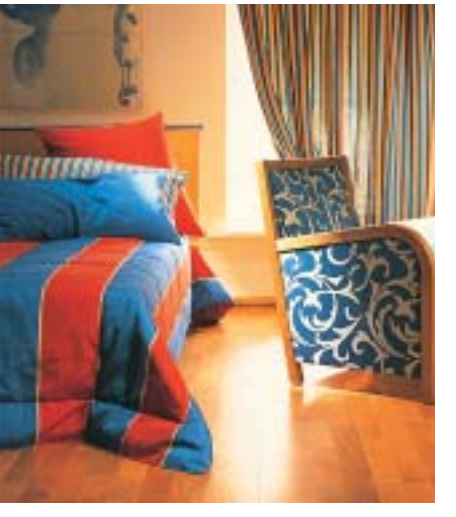
Looking good - particularly when the properties of Trevira CS are compared with those of other materials.

Trevira CS is happy to be compared with cotton that has been given a flame retardant finish and - to give only one example - it can be disinfected under hospital conditions without difficulty. In addition it has