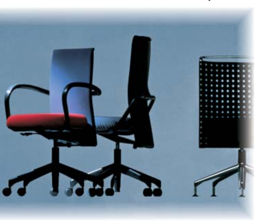
In public areas upholstery fabrics have to comply with strict requirements. They are fulfilled by Trevira CS.

Upholstery fabrics – for instance on chairs – set the tone in many areas. But accidents can often occur where people eat a lot. A good thing, then, that these fabrics are quite easy to keep clean.