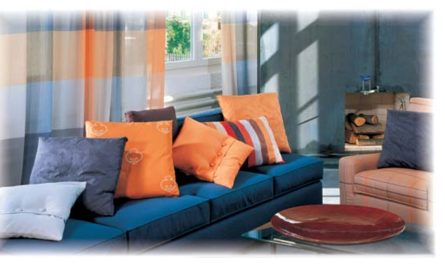
Trevira CS fabrics in a modern hotel suite.

It is often textiles that help a fire to spread. They are key factors in determining how serious the incident is... or in reducing the danger. But only when the fabrics are flame retardant and their effectiveness is not reduced by use or age. When they are fabrics that remain just as safe after washing as before. Like Trevira CS fabrics. Their flame retardancy is anchored permanently in the molecular structure and can never be removed.